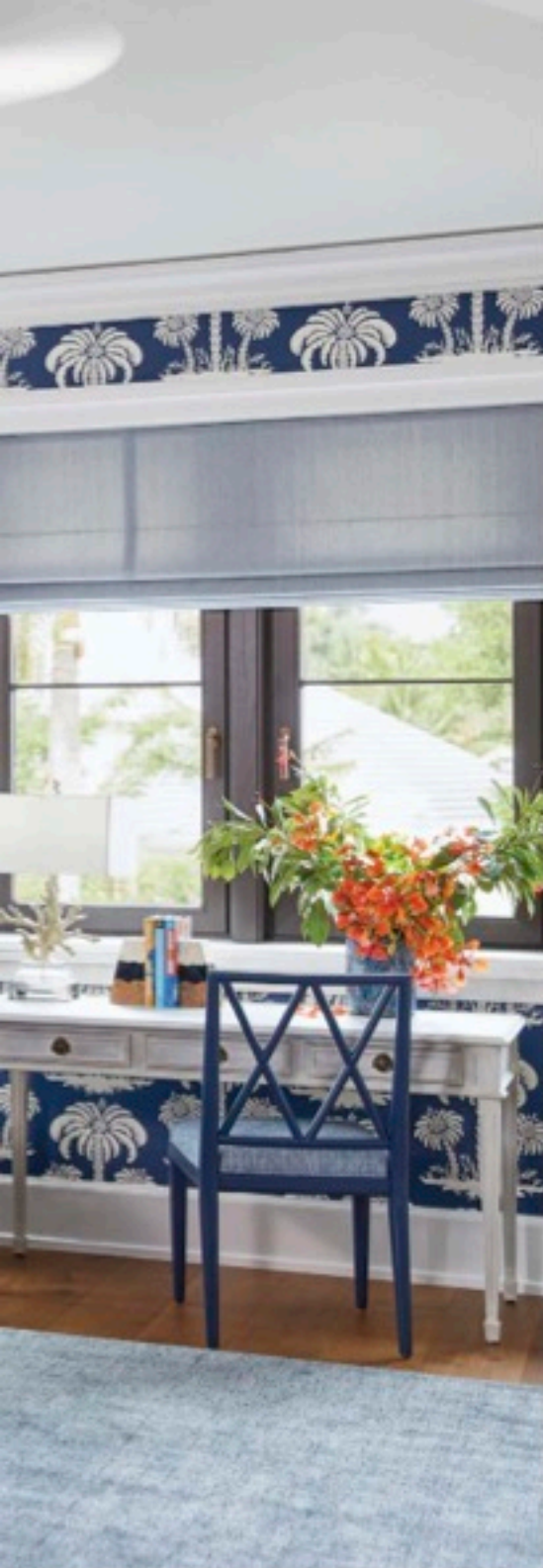
above right: The home office features a shared work table (custom built by Old Biscayne Designs) rather than a single-person desk, which serves to modernize the space and allows the couple to work together.